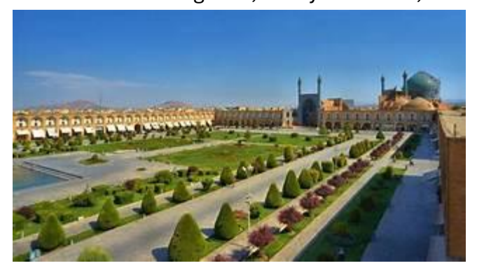
Figure 1 Nagsh-e Jahan Square

There are rules for dress in most areas, particularly for women. There are four styles, the Hijab, the Chador, the Niqab and the Burka. The Hijab is a headscarf which hides the hair, ears and neck. Only the oval shape of the face is visible. The Chador has a full cloak which covers the body and the hair, this is most common in Iran and Afghanistan. The Niqab is a veil which covers a person including the mouth and nose. The Burka is a full veil, covers the head and body with a grill over the eyes. Dennis said that their tour guide, a lady in her 30s, wore a Hijab.